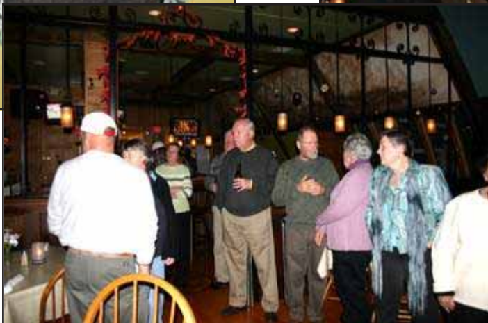
Scenes From Meet 'n Greet